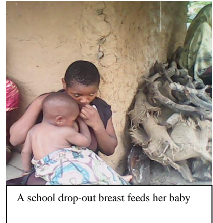
A school drop-out breast feeds her baby